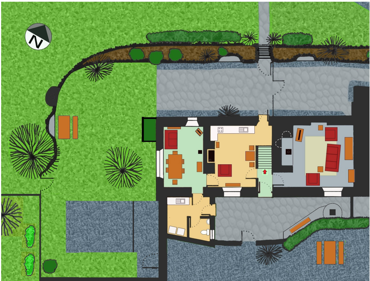
GROUND FLOOR PLAN OF THE FARMHOUSE

There are two front entrances to the Farmhouse. The main doorway (860mm/33.9ins wide) opens inward into a compact hallway (960mm/37.8ins x 1120mm/44ins) over a small sill (45mm/1.8ins high). The door is opened by a large old-fashioned key, inserted into the lock upside down, and turned clockwise. There is coir matting on the floor. There are doorways either side to the kitchen and sitting room, and a staircase straight ahead.