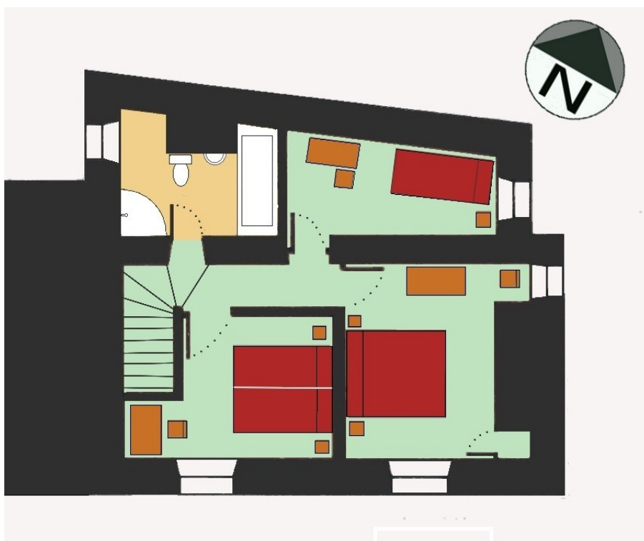
FIRST FLOOR PLAN OF INGLENOOK COTTAGE

The staircase and landing are well-lit and carpeted with short-pile carpet. The stairs (780mm/30.7ins wide) has 8 risers straight ahead (each 215mm/8.5ins high) with a handrail on both sides. The stairs then turn to the right with four triangular steps up to the landing (the narrowest part of the landing is 740mm/29.1ins wide). There is a low level night light to help illuminate the top of the stairs. There is a small dresser/bookshelf and a rug-runner on the carpet.